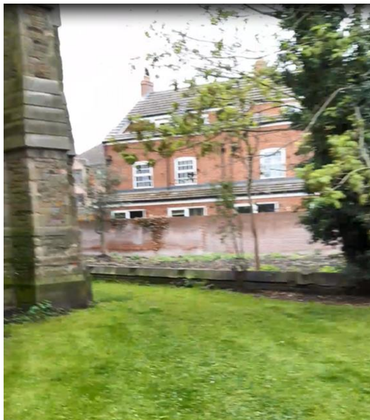
View east facing towards the site