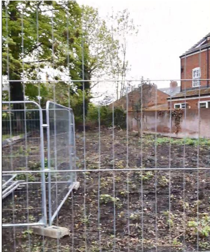
View south facing into the site