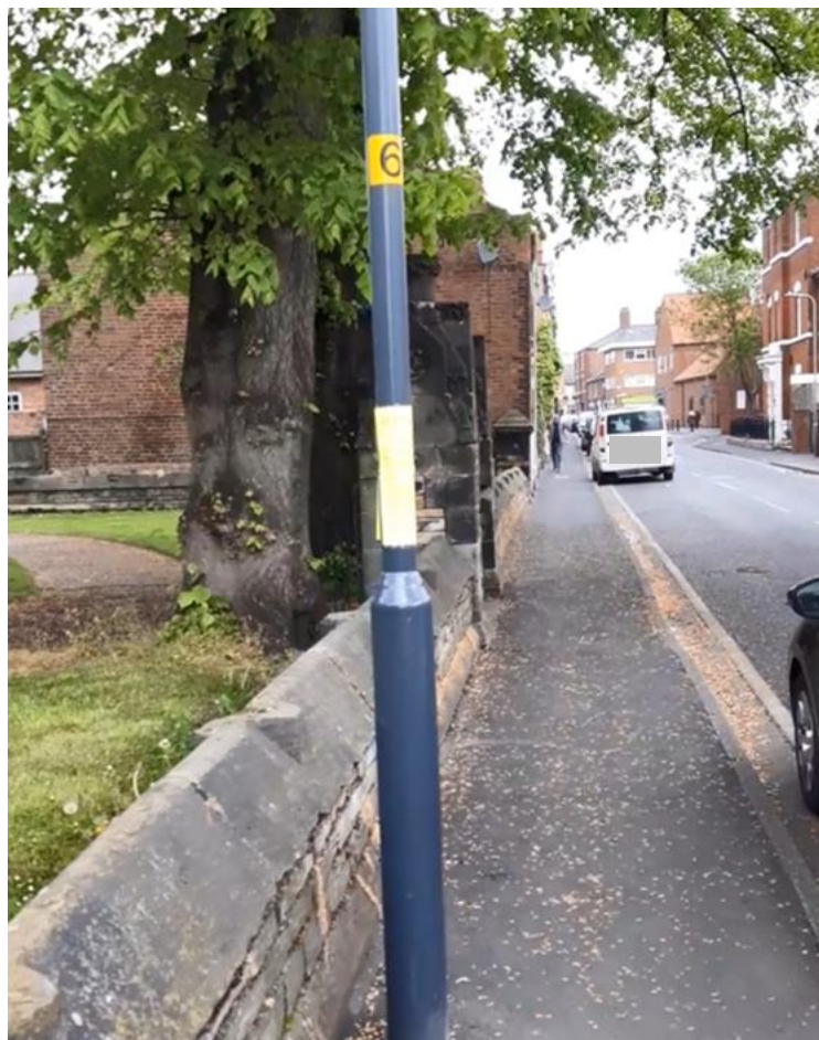
View north along New Lane