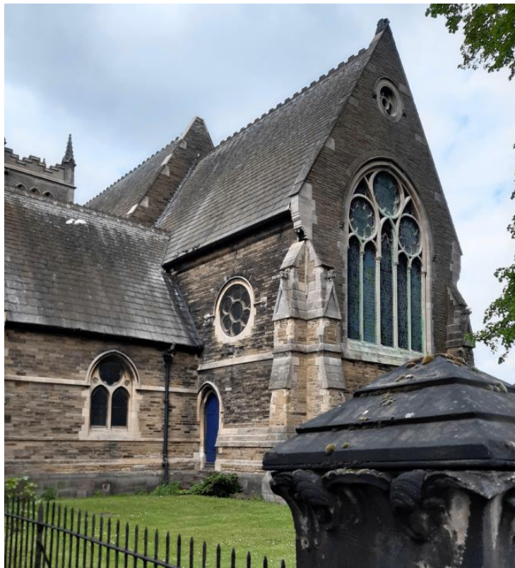
View of Grade II Listed Building St James Church from New Lane